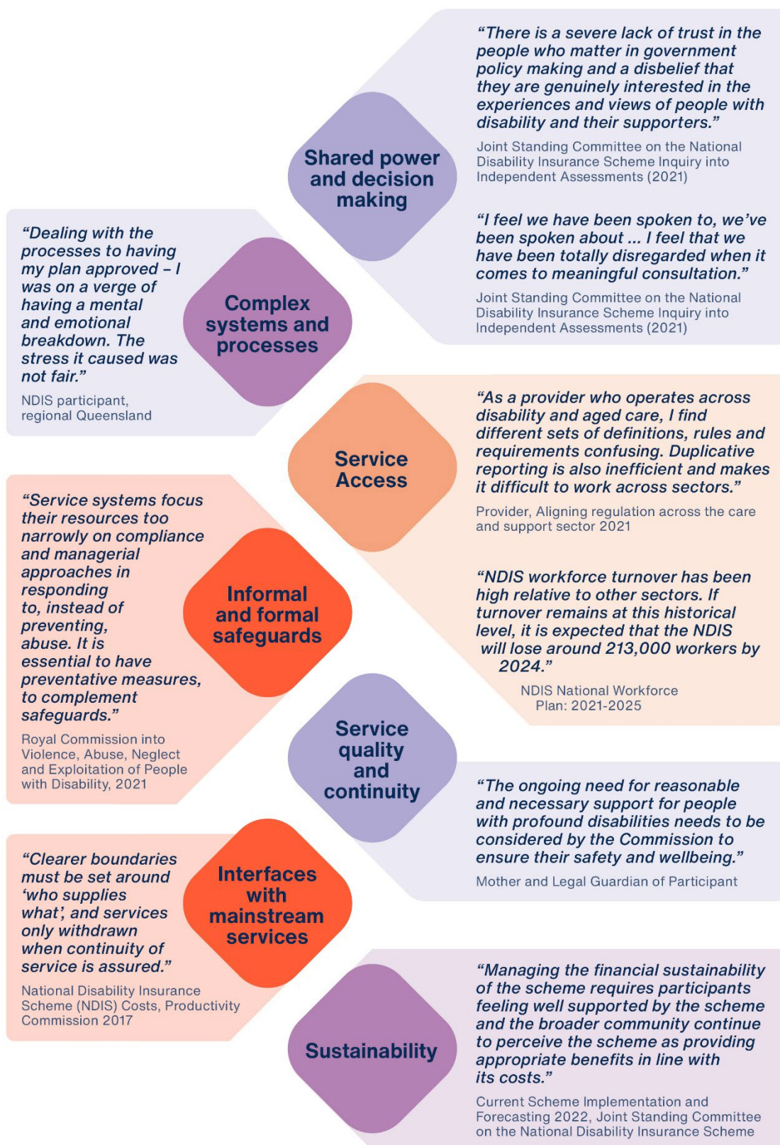
Figure 1. Some areas identified as opportunities for improvement